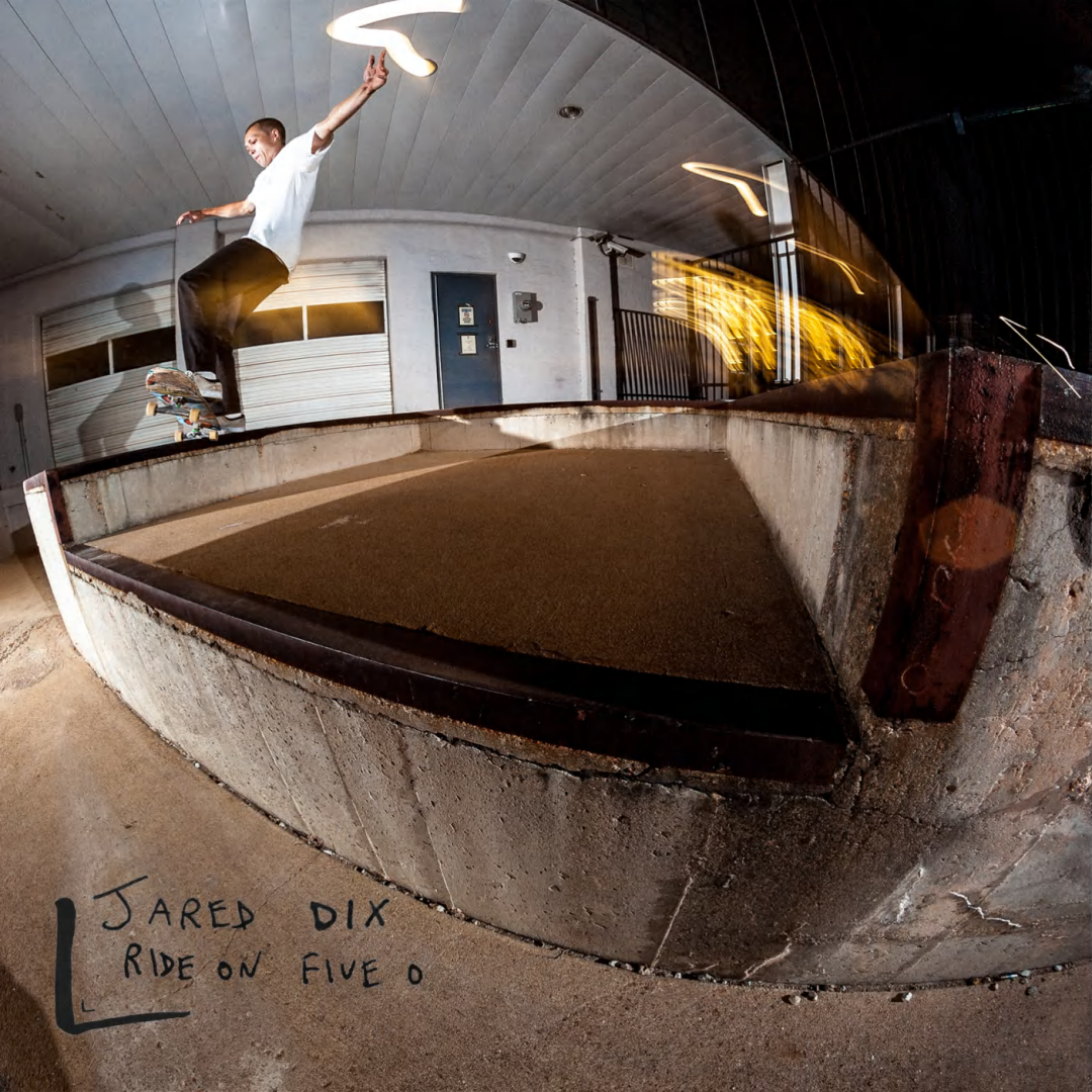
JARED DIX RIDE ON FIVE 0