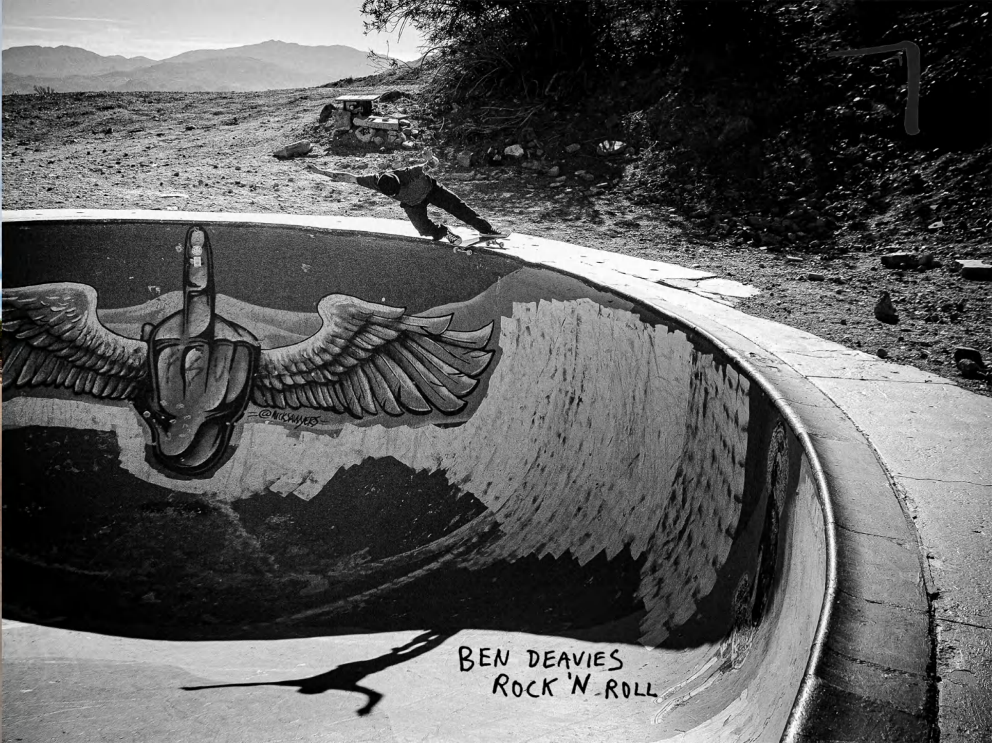
BEN DAVIES ROCK 'N' ROLL