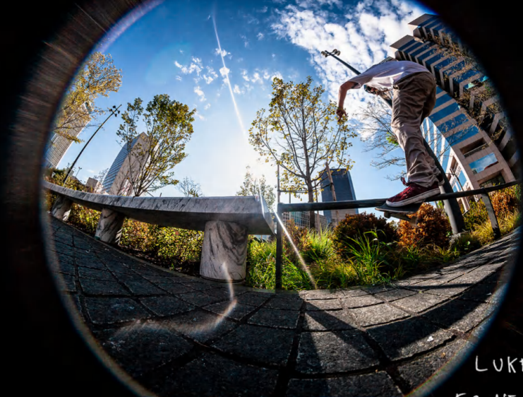
LUKE SHARTZER FRONT SMITH TO FIVE O