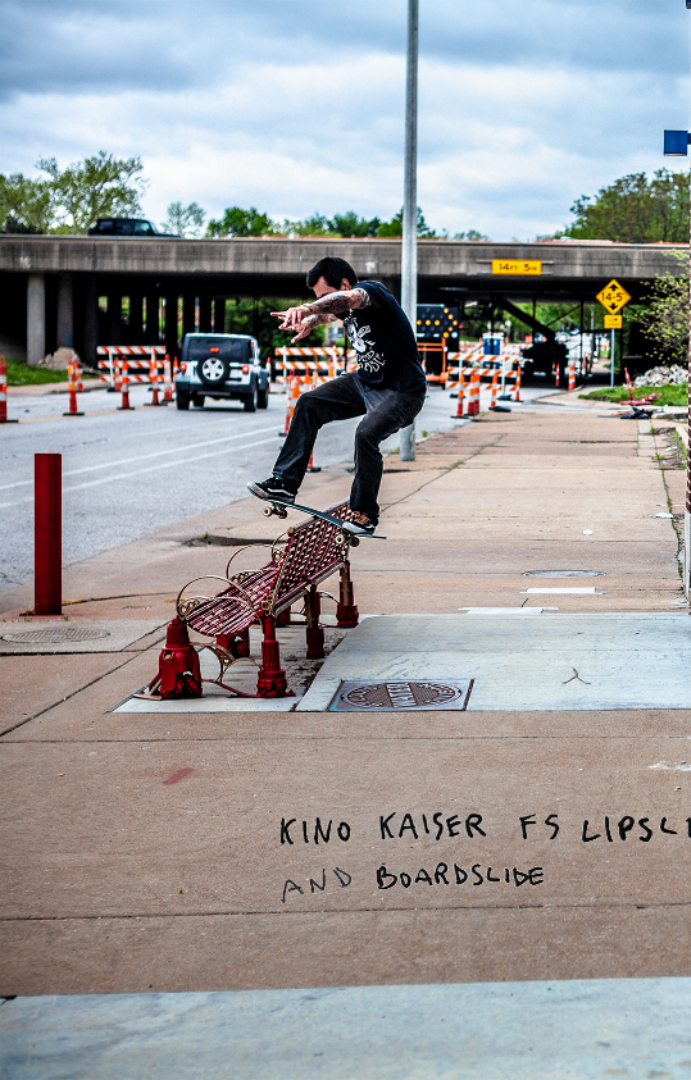
KINO KAISER FS LIPSLIDE AND BOARDSLIDE